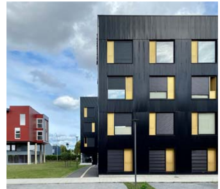
Facade made of metal sheet.