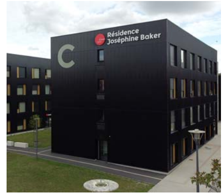
Last building of the residence. Aerial view.