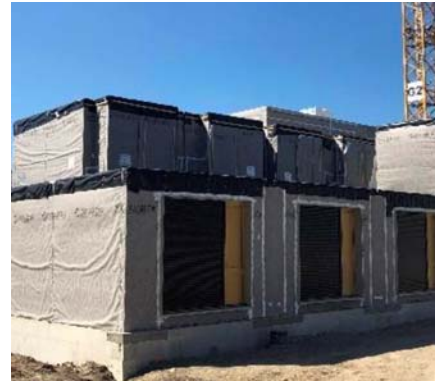
Assembly of prefabricated CLT boxes. Ossabois