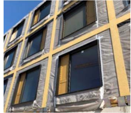
CLT boxes with exterior isolation. Ossabois