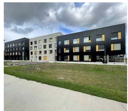
Student residence made up of different buildings.