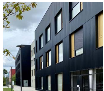
Façade towards the main part of the campus.