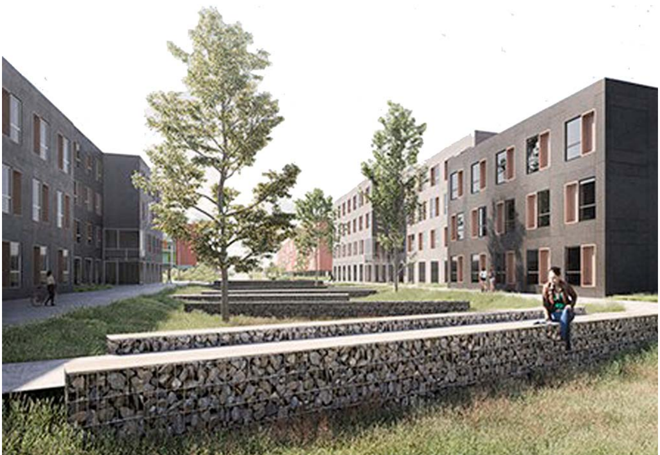
Infographycs from the public space