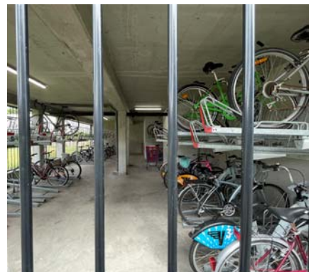
Bike parking. First floor concrete slab.