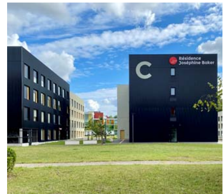
Side façade of the residence.